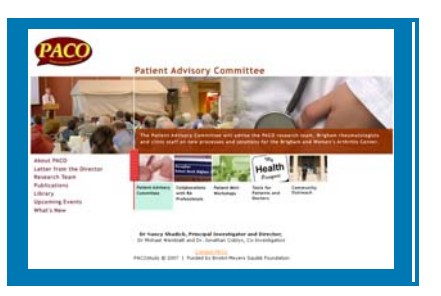
PACO Website wwwPACOstudy.org

"Patients and physician working together to comanage their disease - all aspects of living with the disease so that patients do as well as they can."