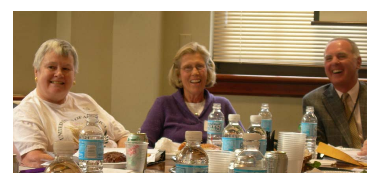
Photographs from the meeting